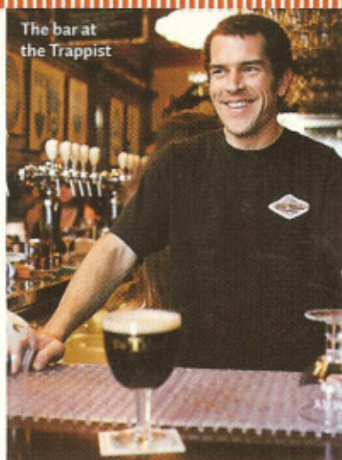
The bar at the Trappist